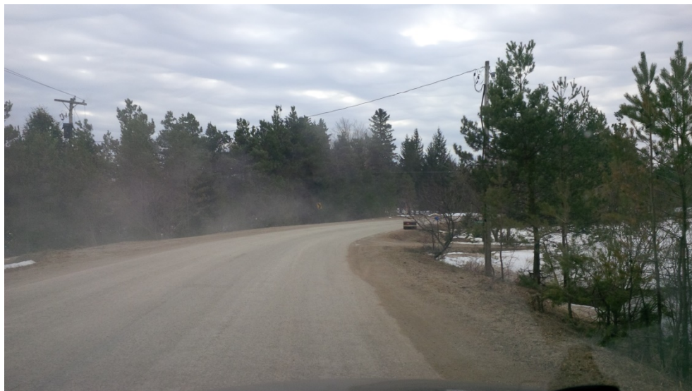
Figure 2: Looking South on South-East Bend of Sideroad 60

During the site visit, a tanker truck was observed to encroach onto the opposing lane while turning along the S-curve of Sideroad 60. Based on that observation, considerations should be given to address horizontal sight line issues along Sideroad 60. Possible solutions include trimming of shrubs and trees within road right of way.