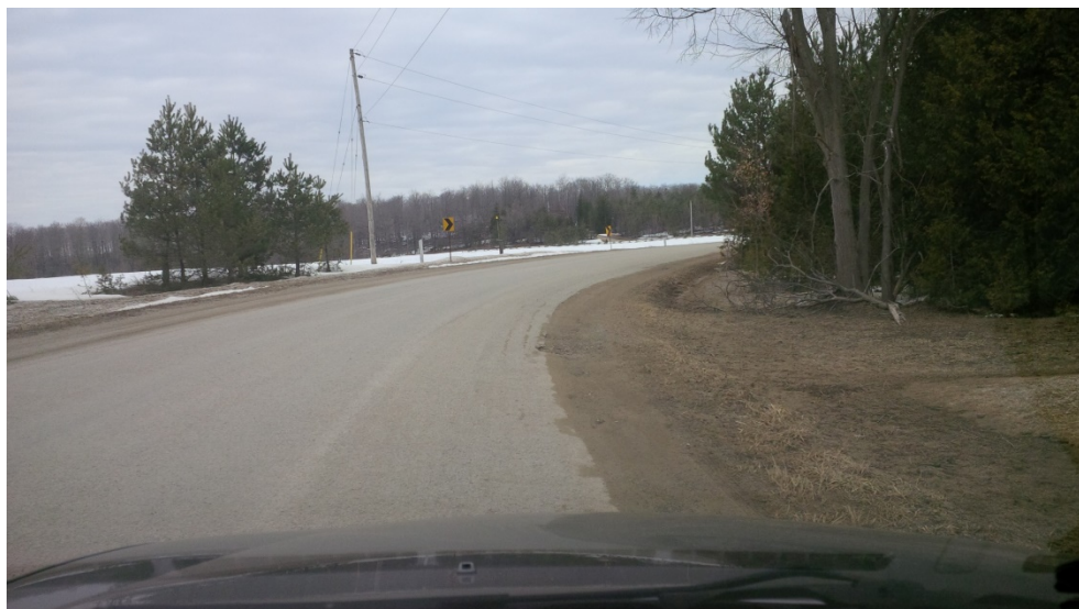
Figure 3: Looking North on North-East Bend of Sideroad 60