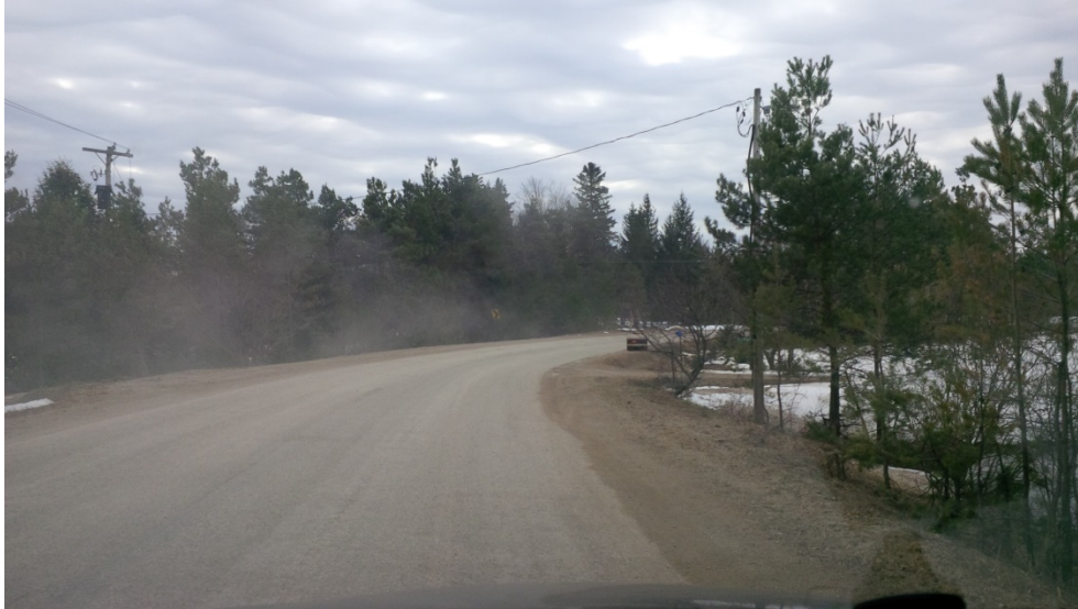
Figure 2: Looking South on South-East Bend of Sideroad 60

During the site visit, a tanker truck was observed to encroach onto the opposing lane while turning along the S-curve of Sideroad 60. Based on that observation, considerations should be given to address horizontal sight line issues along Sideroad 60. Possible solutions include trimming of shrubs and trees within road right of way.